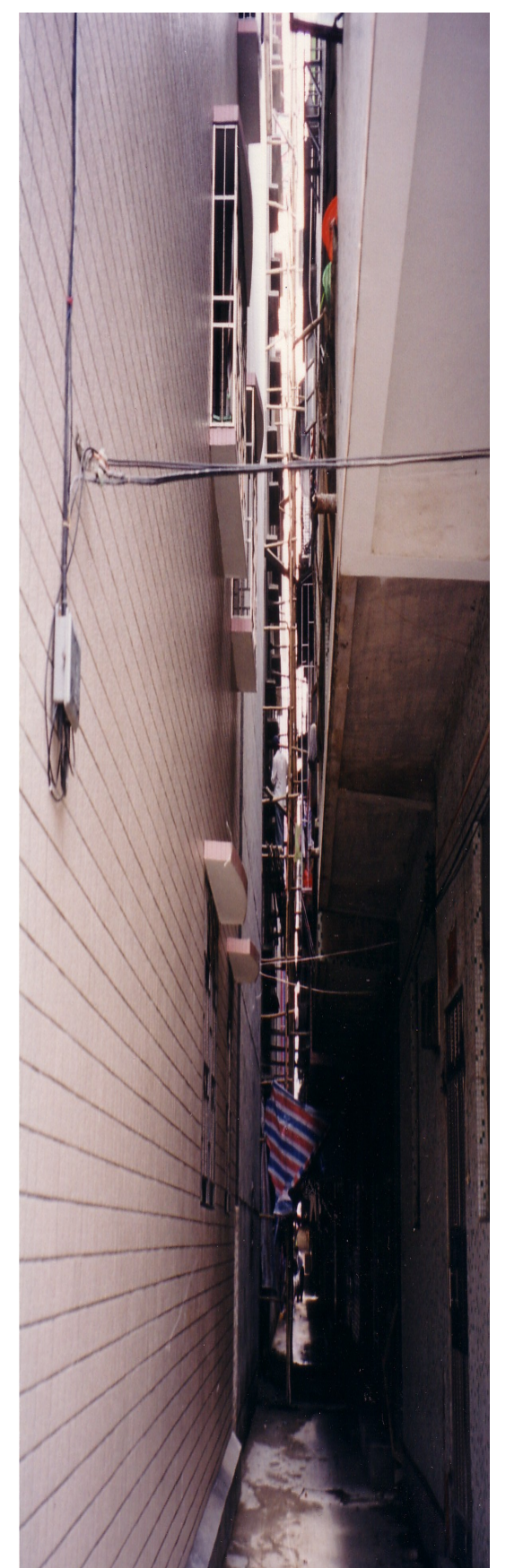
图片: 广州某城中村的“接吻楼” „kissing-buildings“ in an urban village in Guangzhou