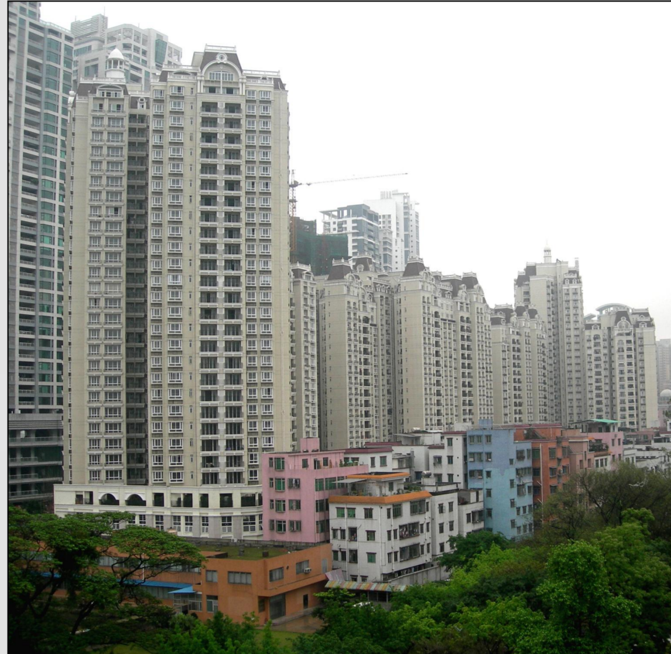
Photo: Disparities side by side: foreground: part of Xiadu village, Guangzhou; background: gated communities alongside the Pearl River waterfront.

The Priority Programme “Megacities – Megachallenge: Informal Dynamics of Global Change” (SPP), funded by the Deutsche Forschungsgemeinschaft (DFG), combines a total of six projects in the Pearl River Delta, China, and three projects in Dhaka, Bangladesh. It aims at a deepened understanding of the connection between the highly complex and informal megaurban processes and the mutual forms and effects of global change as well as the reorganisation of spatial, social and institutional relationships in the megacities.