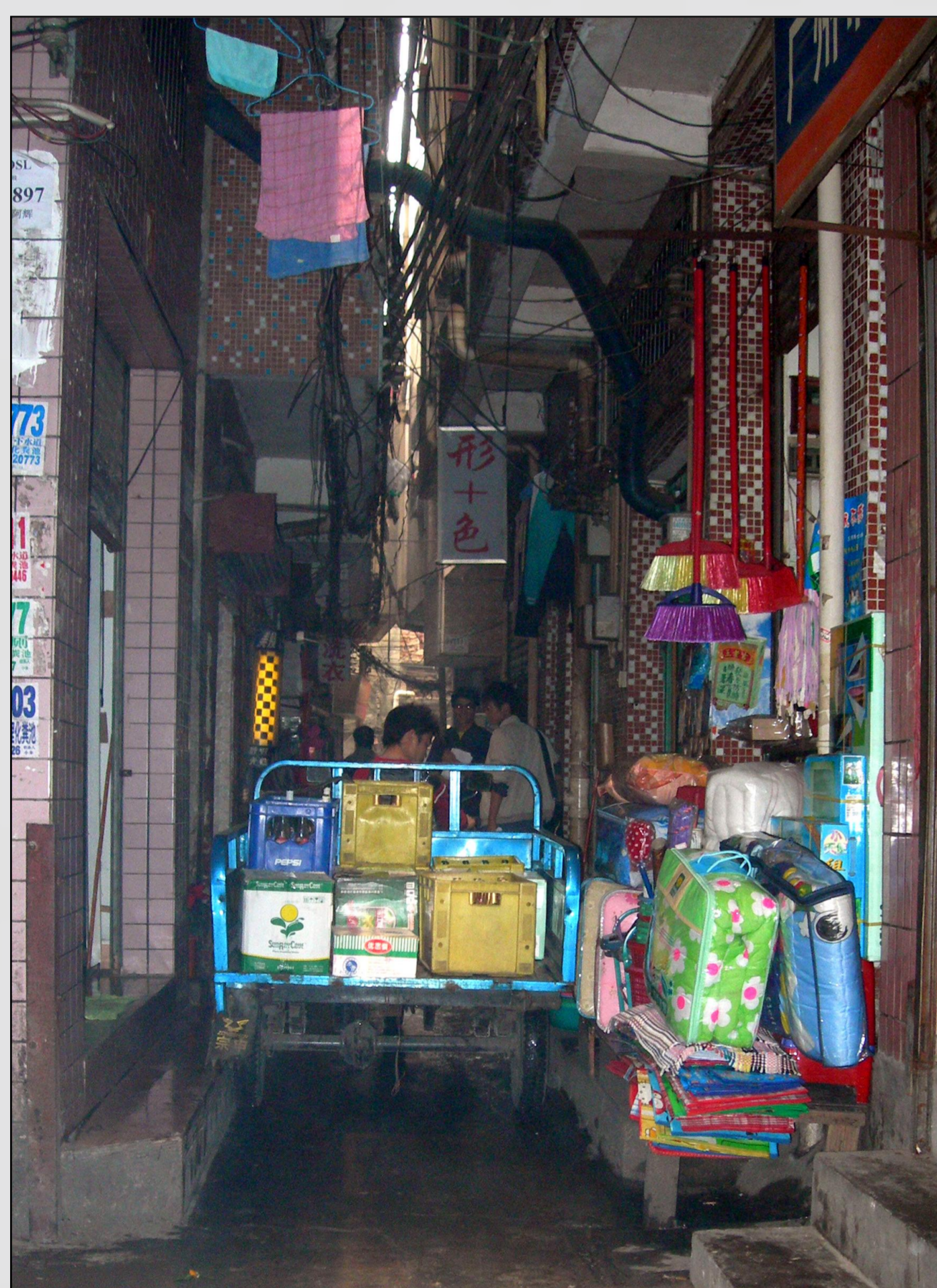
Photo: One of the main shopping streets in Xiadu village, Guangzhou. As the balconies of the so-called „kissing-buildings“ almost touch, day turns into night.

Closely bonded to the frame of the SPP, the project focuses on the interrelation between the dynamic flows of informal migration and megaurban health strategies. Thereby, underlying and influential formal and informal institutional and social structures shall be identified and their impact evaluated.