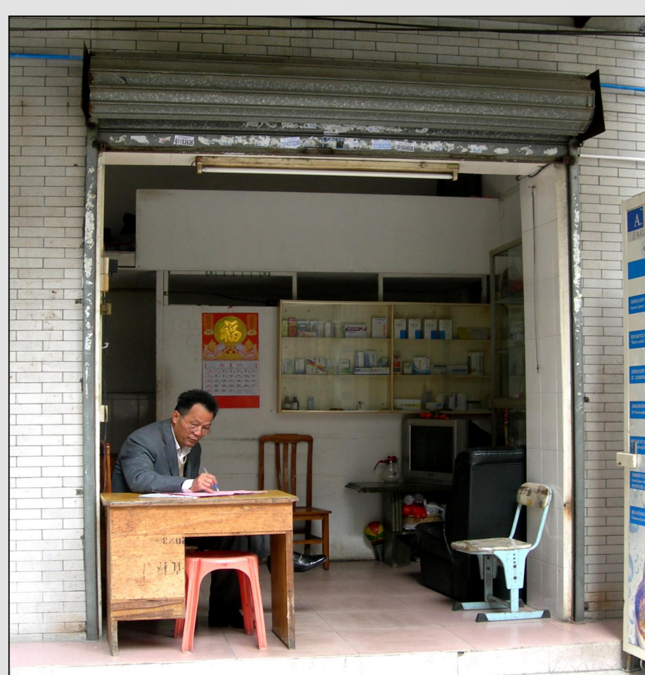
Photo: Informal Clinic in Guangzhou.

Informal processes and structures play a growing role in China’s megacities of which the migrants are especially concerned. Dimensions of informality are informal migration into Chinese cities and the resulting emergence of an informal sector. Additionally – due to limited access to health services – informal health networks of migrants as well as informal or illegal health care providers that compete with low prices to the formal health facilities become increasingly important.